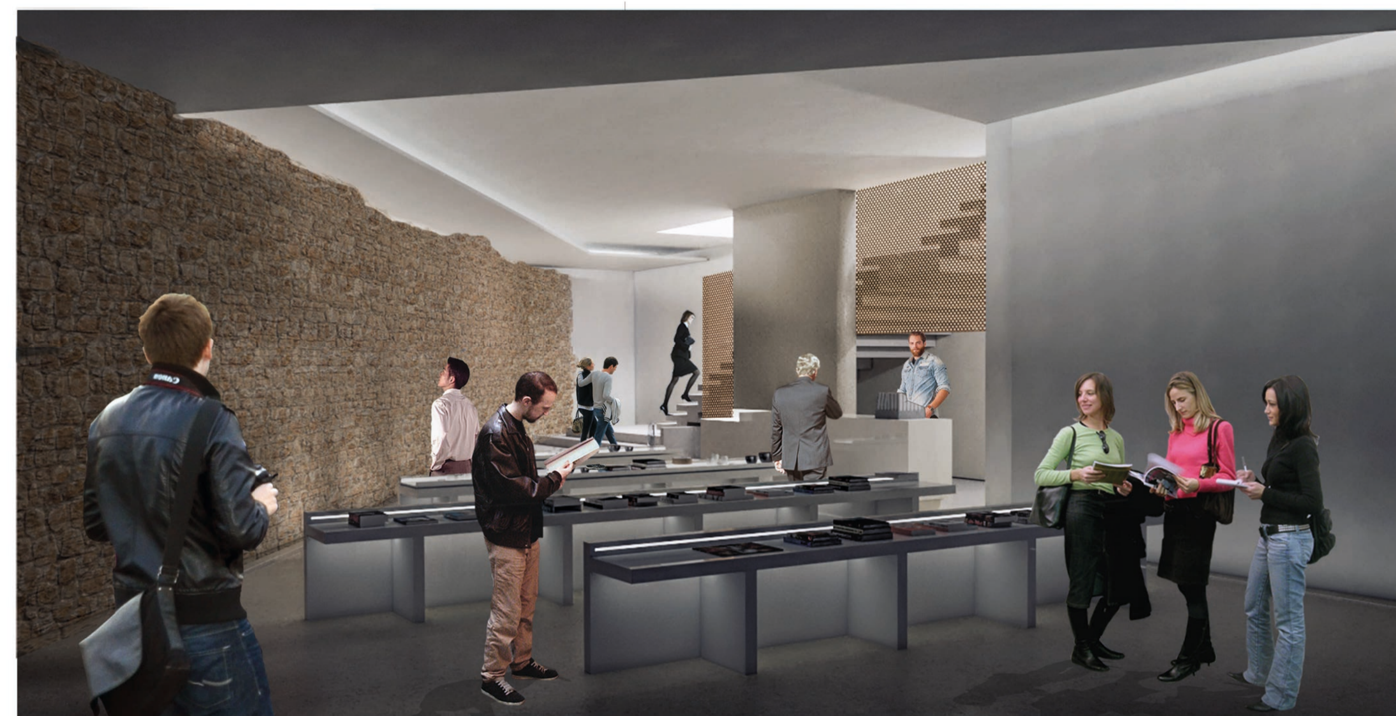
VISTA TRIDIMENSIONALE DAL PUNTO DI VISTA PREFISSATO (VEDI PIANO INTERRATO)